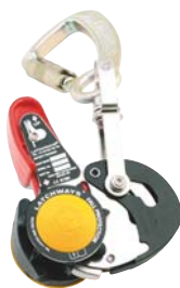
Latchways TowerLatch™ System