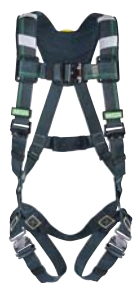
EVOTECH® Arc Flash Harness