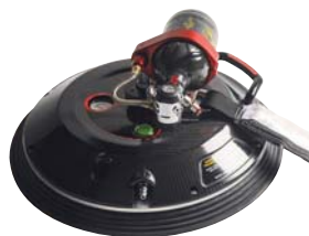
Latchways WinGrip® Vacuum Anchor System