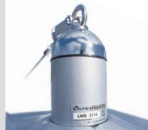
Latchways Constant Force® Post

Note: This Bulletin contains only a general description of the products shown. While uses and performance capabilities are described, under no circumstances shall the products be used by untrained or unqualified individuals and not until the product instructions including any warnings or cautions provided have been thoroughly read and understood. Only they contain the complete and detailed information concerning proper use and care of these products.