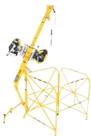
MSA XTIRPA™ System for Confined Space Entry